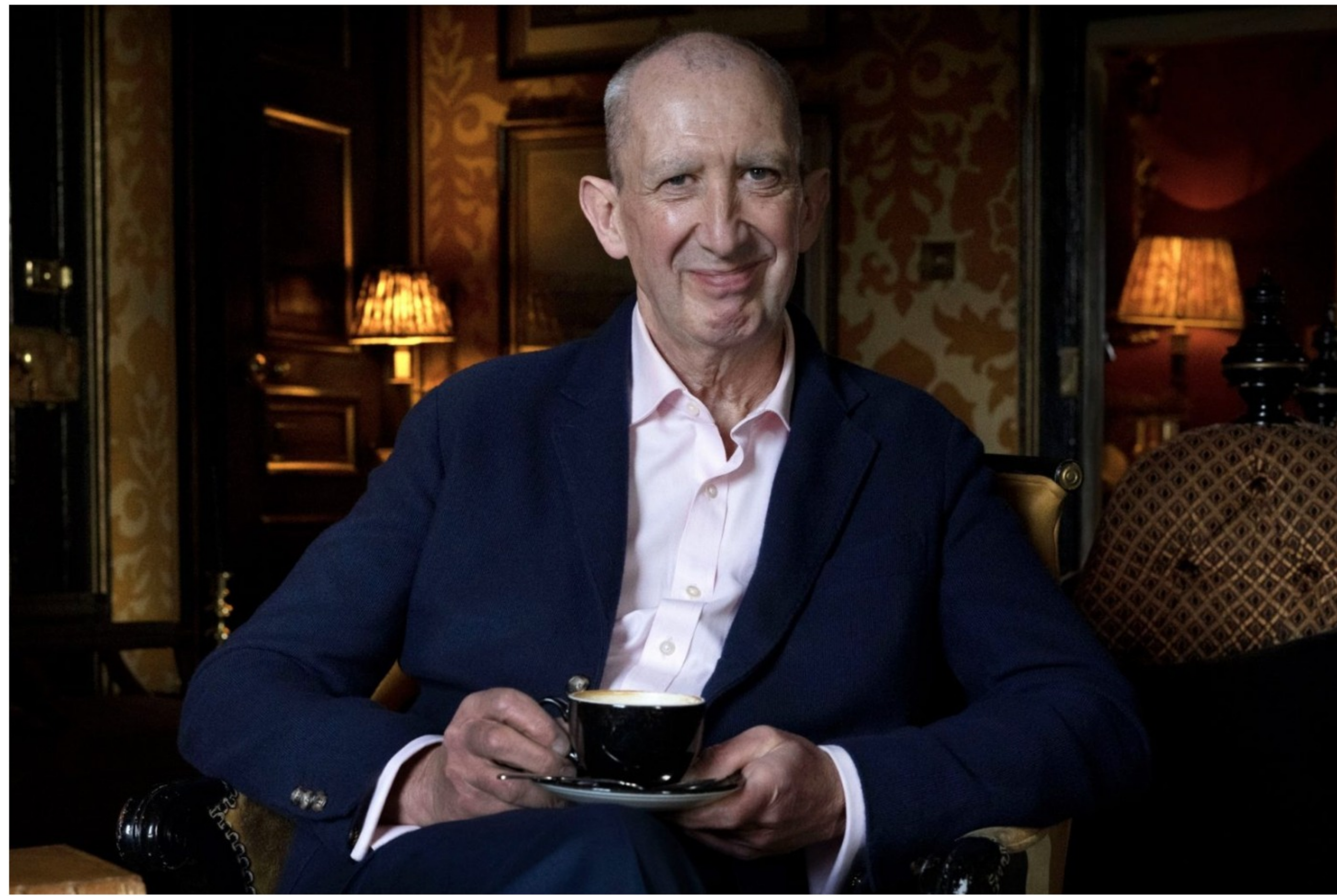
Owner of Prestonfield House and The Witchery