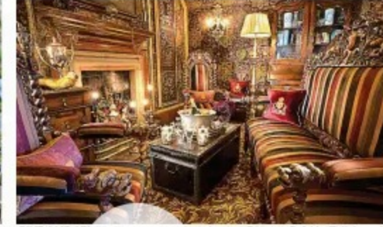
interiors at Prestonfield in Edinburgh

Don't miss: Ludlow, which is only around