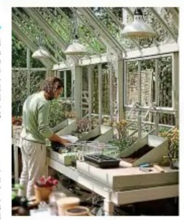
RICH PICKINGS: Part of the kitchen gardens at Le Manoir aux Quat'Saisons

gardening course. Details: B&B doubles from £925