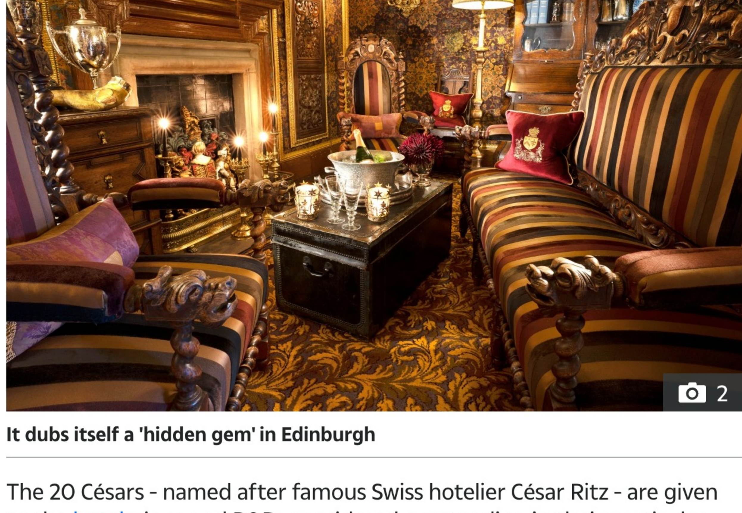
It dubs itself a 'hidden gem' in Edinburgh

The 20 Césars - named after famous Swiss hotelier César Ritz - are given to the hotels , inns and B&Bs considered outstanding in their particular category.