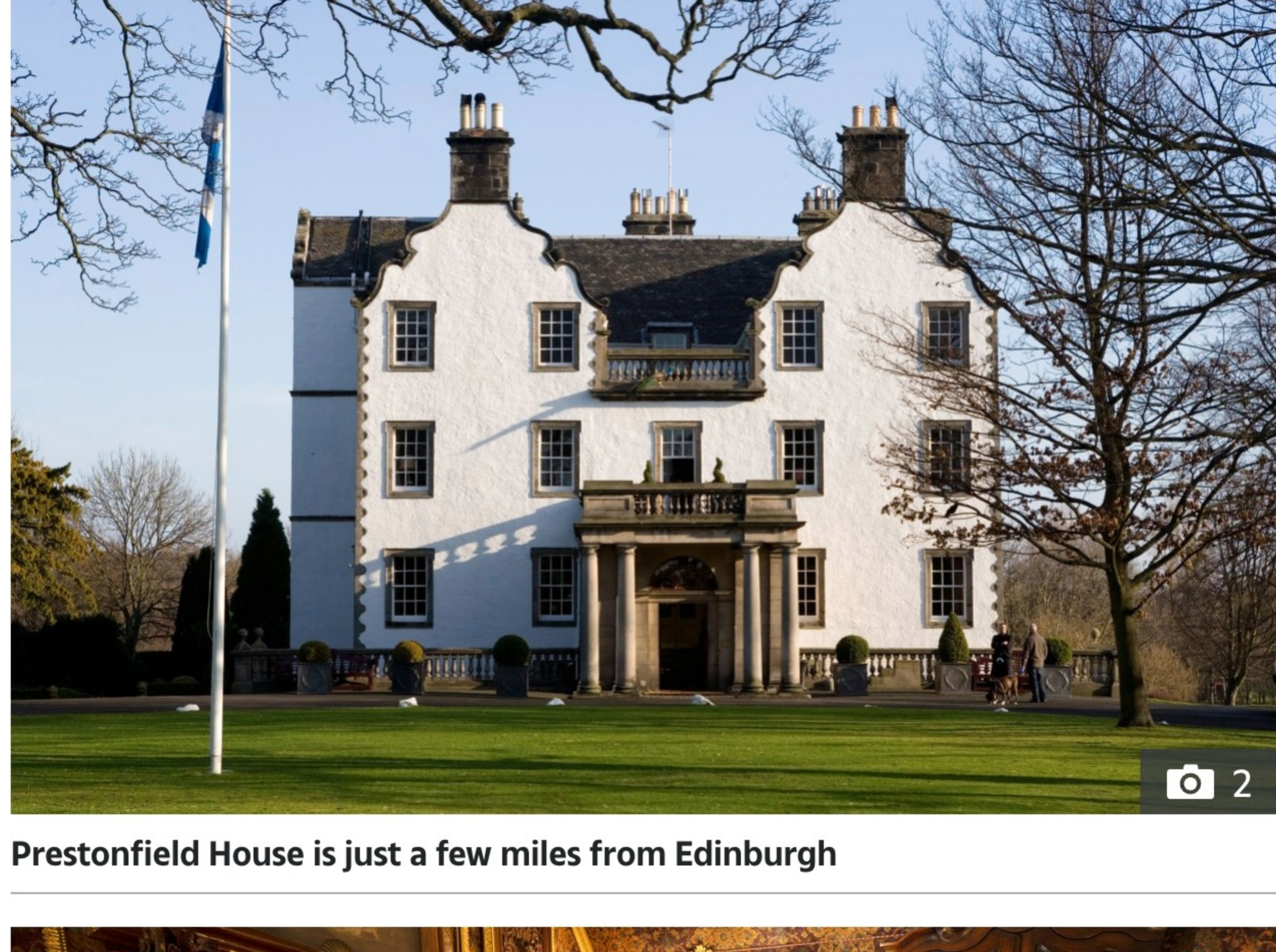
Prestonfield House is just a few miles from Edinburgh

Your info will be used in accordance with our Privacy Policy